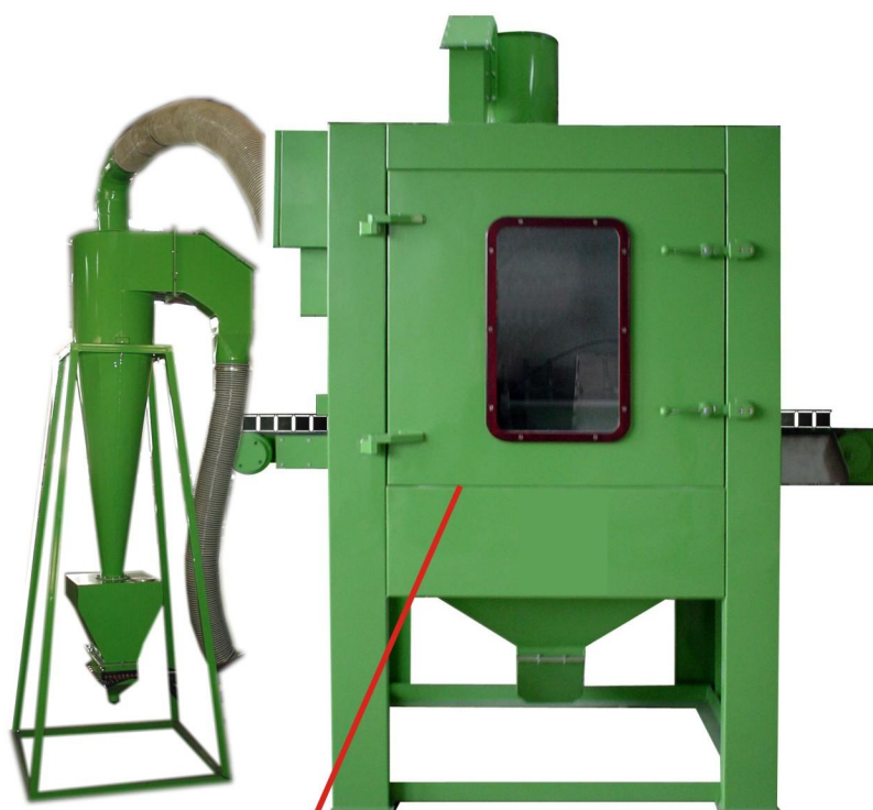
Lead frame deflashing

--Parts are manually loaded at entry bay and automatically conveyed into the cabinet for automatic blasting on single/both sides of the workpiece.