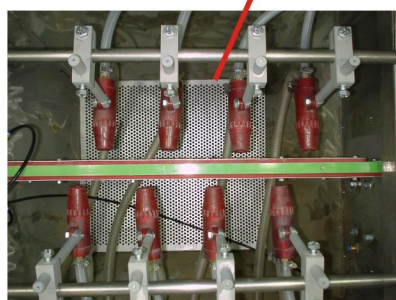
8 Guns simultaneous double side blasting