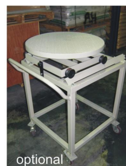
optional Turntable Trolley