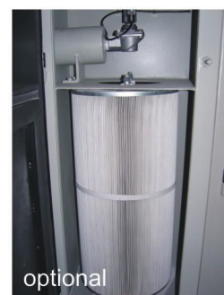
optional Cartridge Dust Collector