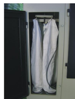
Dust Bag Dust Collector