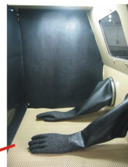
large bright interior