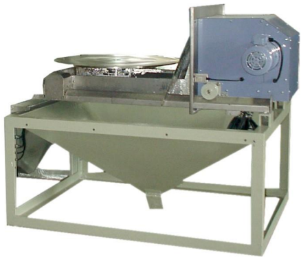
Stainless steel motorized workcar